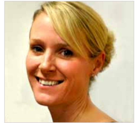
45 MINUTES AFTER TREATMENT, WITH MINERAL MAKE - UP