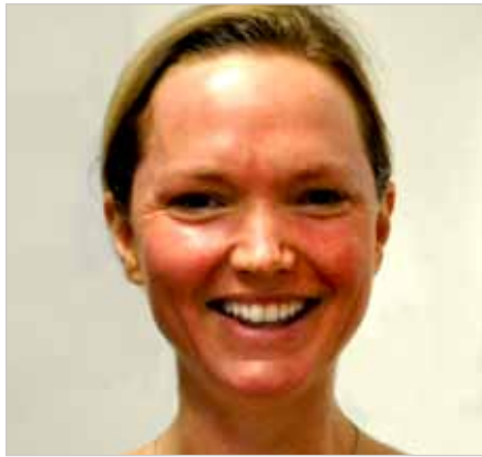
60 SECONDS AFTER TREATMENT